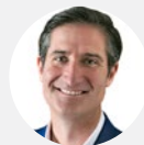
Brian Niccol Chairman and Chief Executive Officer