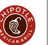
SCOTT BOATWRIGHT CEO, Chipotle

What we serve today helps define the world we live in tomorrow.